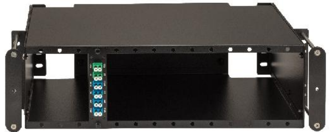
3RU 14 slot LGX® rack-mount panel (pictured) Available in 3RU 16 slot LGX® rack-mount panel