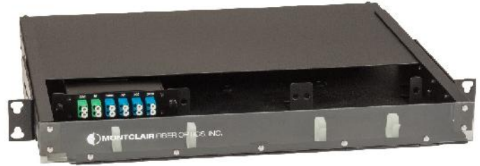
1RU 3 slot LGX® rack-mount panel (pictured)