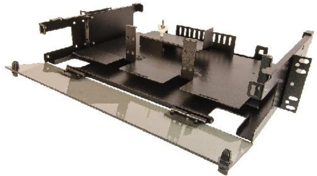
2RU 6 slot LGX® rack-mount panel (pictured)